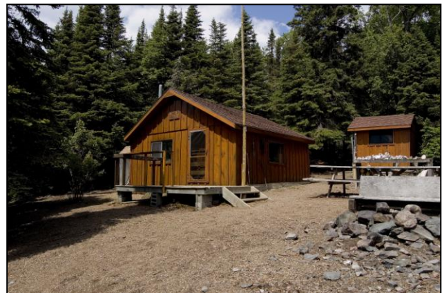
Come and Rest Emergency Cabin at the Slate Islands Provincial Park