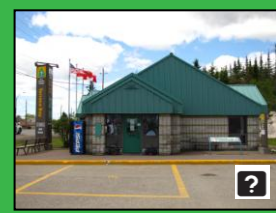
Tourist Info Centre

Lake Superior National Marine Conservation Area