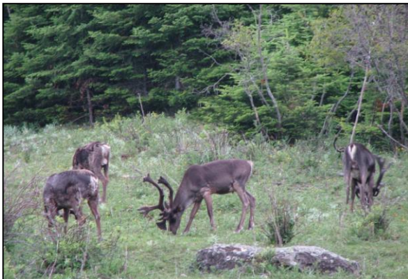
Slate Islands Woodland Caribou