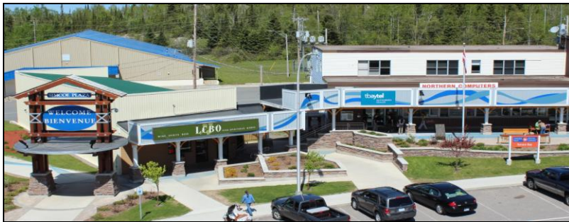
LCBO, Northern Computers & Post Office in Simcoe Plaza