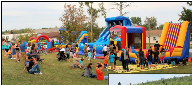
Lighthouse Street Festival

* For specific information on an event, type the event's name into the Google Search Engine .