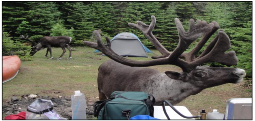
Book a Charter to See the Caribou at the Slate Islands Provincial Park