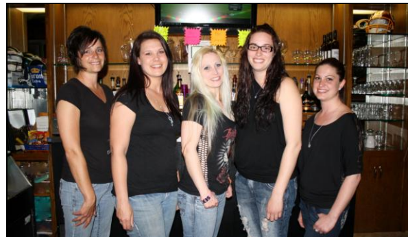
Imperial Bar, located beside Drifters Restaurant 1-807-825-3226, x213