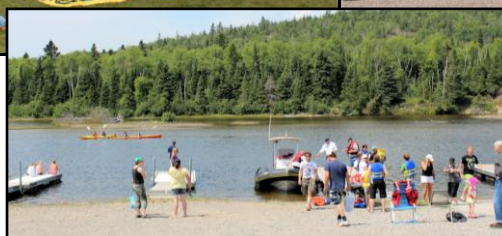
Lake Superior Day