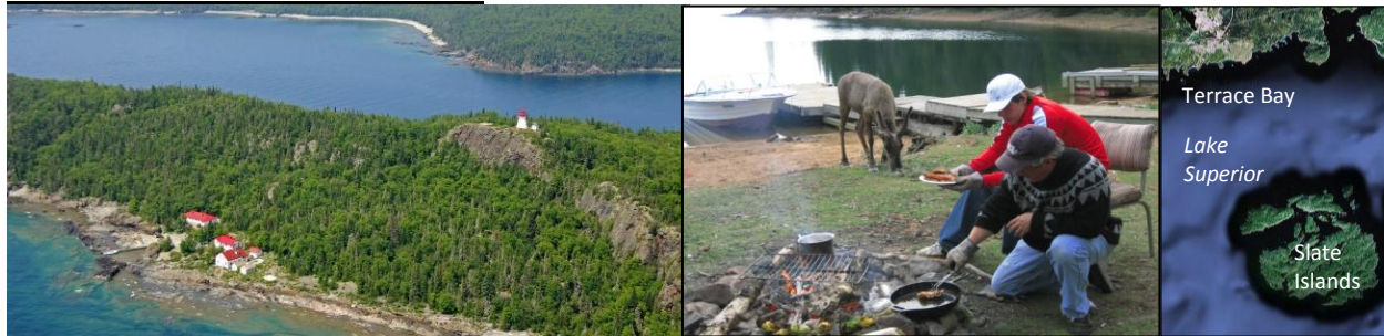
The Slate Islands Lighthouse is the tallest on Lake Superior standing 224 feet above sea level

The Slate Islands Provincial Park is one of the jewels of the North Shore of Lake Superior! It is made up of two main islands, five minor islands and numerous islets located 11km across Lake Superior from Terrace Bay Beach. The islands are believed to have formed over a billion years ago when a huge asteroid smashed into the earth. The meteor strike has left the Slates with a 10m long shattercone rock formation, which is believed to be the largest of its kind in the world.