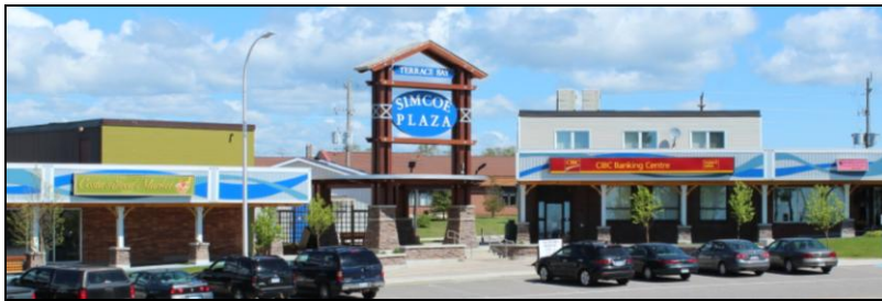
Costa's Grocery Store, CIBC Banking Centre & Strawberry's Floral Boutique in the Centre of Simcoe Plaza