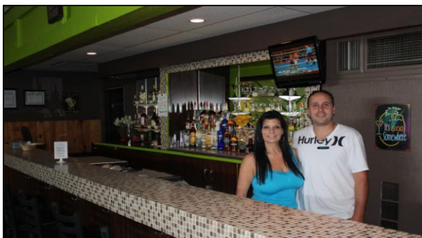
The Cave Lounge, located in the Red Dog Inn 1-807-825-32856, x133