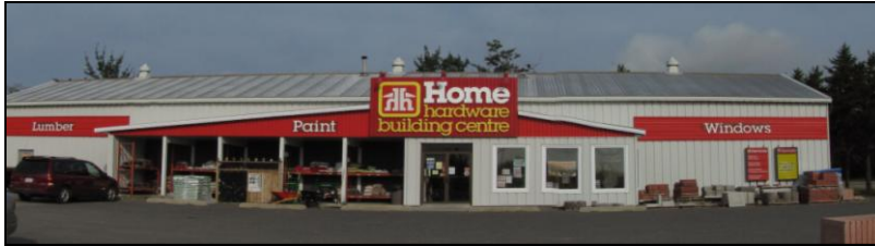
Home Hardware on Mill Road/Highway 17