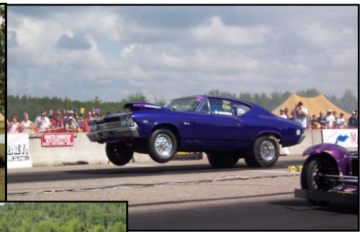
Terrace Bay Dragfest