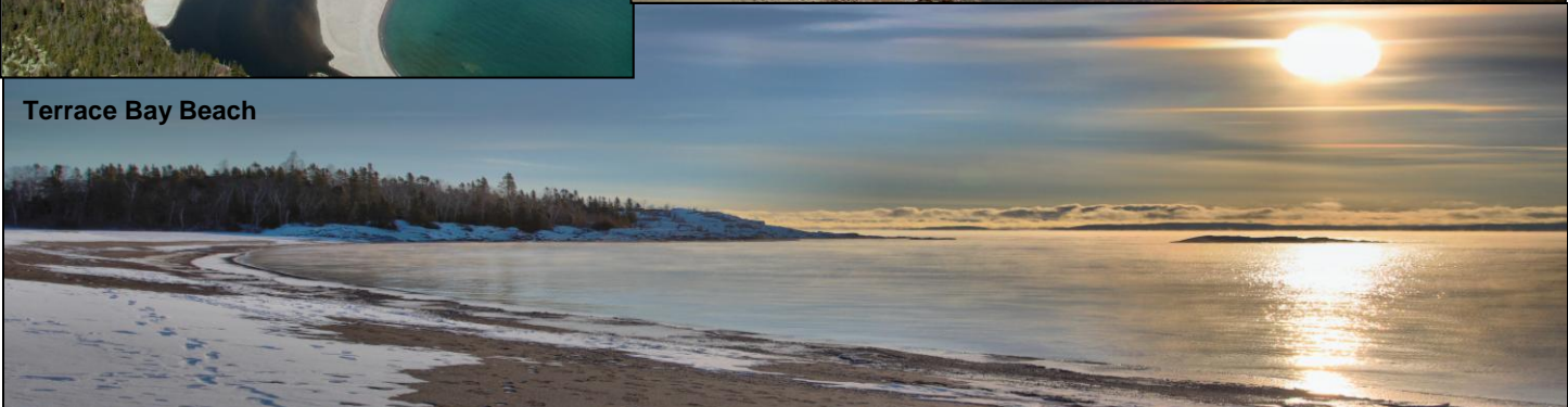
Terrace Bay Beach