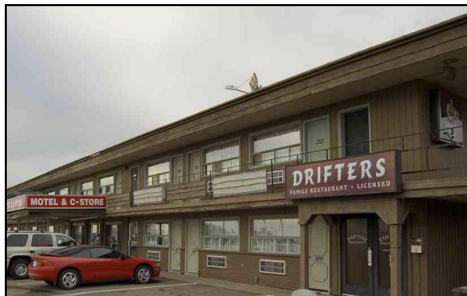
Close-up of the Motel Office and Restaurant