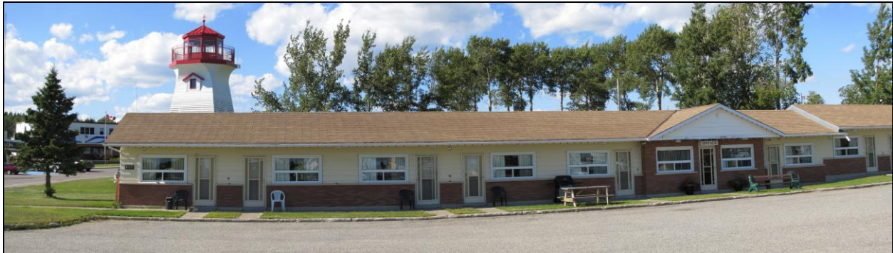
The Motel View from the Highway

Highway 17, Terrace Bay, Ontario, POT 2WO Phone (807) 825-3282, Fax (807) 825-9278