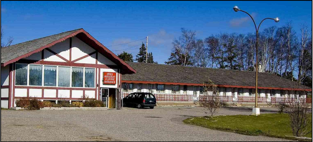
View of the Red Dog Inn from the Highway

The Red Dog Inn is a newly renovated facility with a fully licensed dining located in the centre of Terrace Bay beside Simcoe Plaza on Highway 17. The Inn features 41 rooms on two levels with some smoking rooms available. The rooms are air conditioned and wheelchair accessible through the back of the building and the Inn is located near the Terrace Bay snowmobile trail.