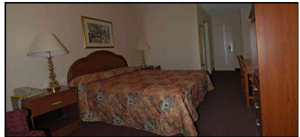
One of the Single Bed Rooms

The rooms range in price from $79 to $99 a night. Senior citizen discounts are offered. Every form of payment is accepted except for personal cheques. The Red Dog Inn is open all year round. Guests can make a reservation by phone. Advance notice is not required to make a reservation, but a credit card is needed. Guests can check in at any time, but usually check out by 11 a.m. Guests must cancel before 6 p.m. of the night of their reservation or they will be charged for the room.