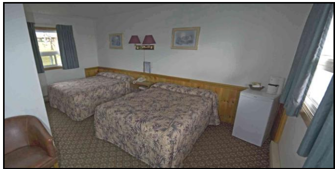
One of the Double Bed Rooms and the Comfortable Check In Area For Travelers

Coffee makers, fridges, telephones with message service, and microwaves are included in each of the rooms. Wireless internet is available for guests throughout the motel. Pets are allowed in the hotel. A full cable package is available for guests to watch television. Wake-up calls, extended reservations and room service are available. The office also has frozen food and snacks and a beverage machine is on site. The motel has fully licensed mini bars with a variety of beer and spirits. All rooms have individual electric heat and are wheel chair accessible, although bathrooms are not handicapped equipped. The motel is open all holidays.