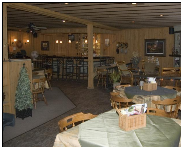
Drifters Restaurant is One of the Most Notable Dining Establishments in Terrace Bay

“Our goal is to provide our visitors with great food, a good night’s sleep, and a chance to meet new friends”