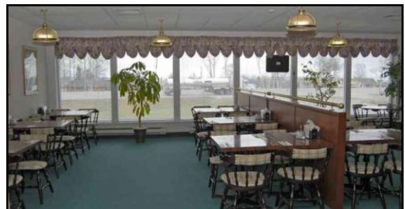
Restaurant also offers Pizza Hut Express

Cable television is available to guests. Pets are not allowed at the Red Dog Inn. Room service can be provided upon request. There are coffee makers in some of the rooms and fridges in most of the rooms. Wireless internet is provided in every room. Red Dog Inn includes a licensed restaurant and Pizza Hut Express. Local pamphlets and brochures are available for guests.